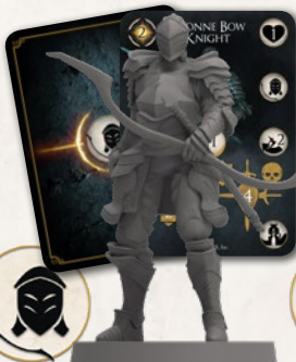
Alonne Bow Knight