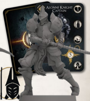
Alonne Knight Captain