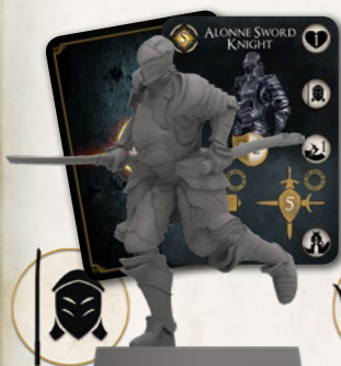
Alonne Sword Knight

To download this rulebook in your language, go to: steamforged.com/darksouls-expansions-rules