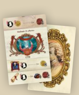
46 Opus cards These are the works of the maestro that you can sponsor over his lifetime.

These represent the memories you have of moments together with Mozart. They allow you to perform actions and earn victory and Story Points.