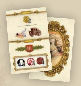
34 Memory cards

These represent the memories you have of moments together with Mozart. They allow you to perform actions and earn victory and Story Points.