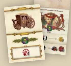
40 starting cards (10 × 4 players)

Each player receives 1 Opus and 9 Memory starting cards.