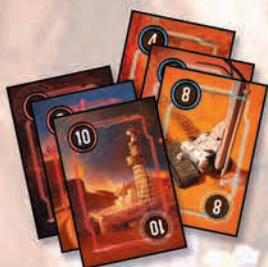
48 Excavation Cards (12 per player)