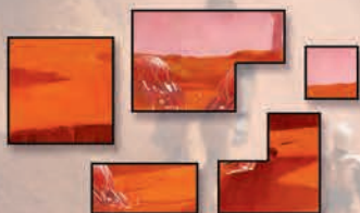
50 Development Tiles (10 of each size)