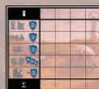
1 Score Sheet Pad