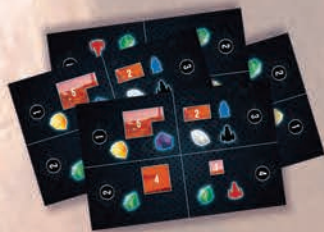
10 Resource Cards