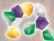
48 Crystals (12 each in 4 colors)