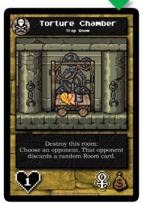
Here! It matches one of the Treasures in Torture Chamber.