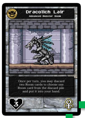
Where can we build Dracolich Lair?

Also keep in mind that ordinary Rooms can <u>always</u> be built over any Room, regardless of treasure type!