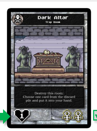
Here! It matches the Cleric Treasure in Dark Altar.