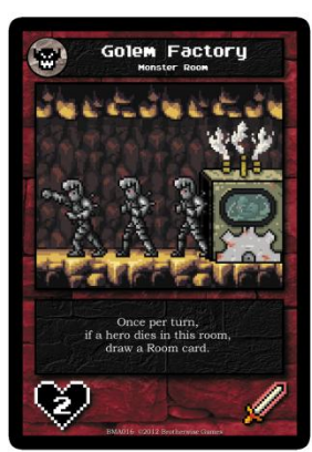
Not here! Golem Factory contains no Cleric treasure.