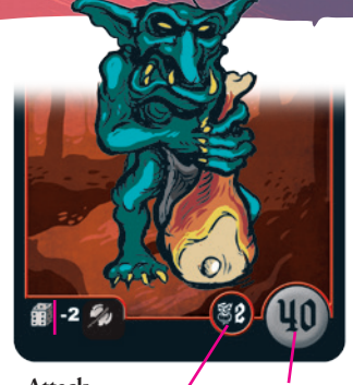
Attack (at the beginning of the defending player's turn)

In the Multiplayer section later in these rules you can see the attack limits of Weapons. In addition, some Weapons have secondary effects, indicated with text on each card, which will take effect after damage from the attack is dealt. In the Secondary Card Effects section later in these rules, some particular situations are explained further.