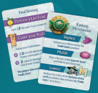
5 Reference cards (1 per player color)