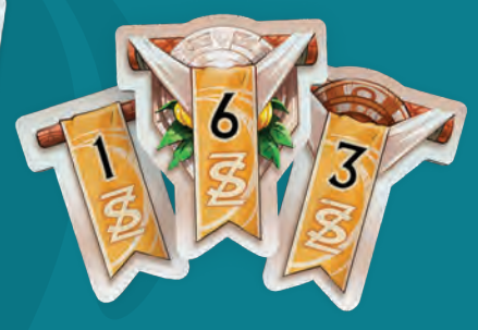
46 Profit tokens (18 x 1s, 16 x 3s, and 12 x 6s rewards)