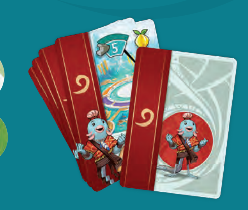
35 Character cards (7 per player color)