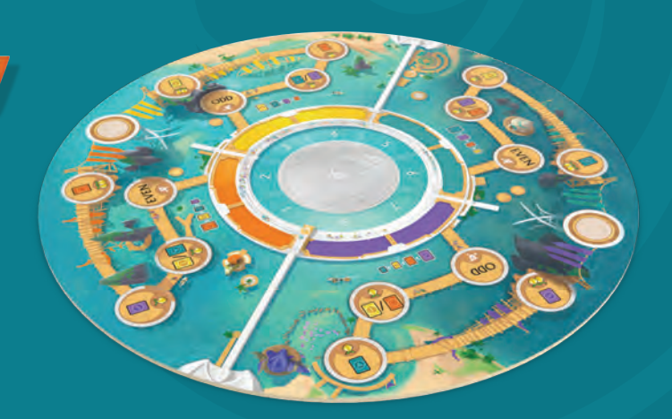
1 Game board