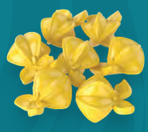
20 Goya Star Fruit