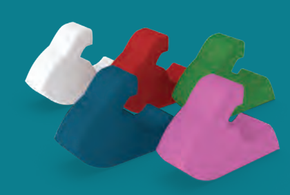
5 Watercraft (1 per player color)