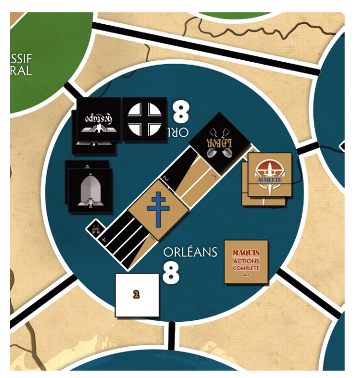
Step 1 : German player declares a Counter-Intelligence Action.

Example #2: It is the following German Impulse. The German player has selected Orleans as his Area of Actions. He has moved in 1 Detachment to the Area so there are now 2 Detachments in the Area.