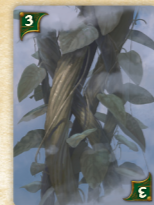
Beanstalk Cards (Green)