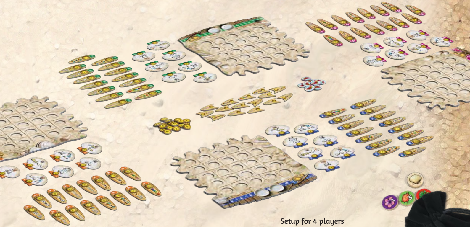
Setup for 4 players