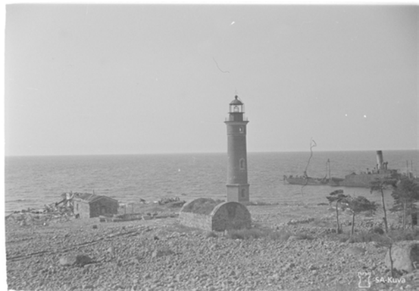
[Above: Lounatrivi Light (southern tip). Note the wrecked ship. Below, Pohjoiskorkia Light at the summit of Pohjoislohko.]

Every one of the minesweepers was damaged in some way, though all managed to escape from the harbour after unloading the first wave. AFPs F-866 and F-867, leading the second wave, were unable to get into the harbour and transferred their troops to sturmboots . F-173 reached the harbour only to be severely pummelled. While escaping it struck a mine and sank; F-866 was damaged by the same explosion. Then, F-822 was set on fire. This was the AFP carrying the 88mm ammunition (5,000 rounds), plus the radio truck.