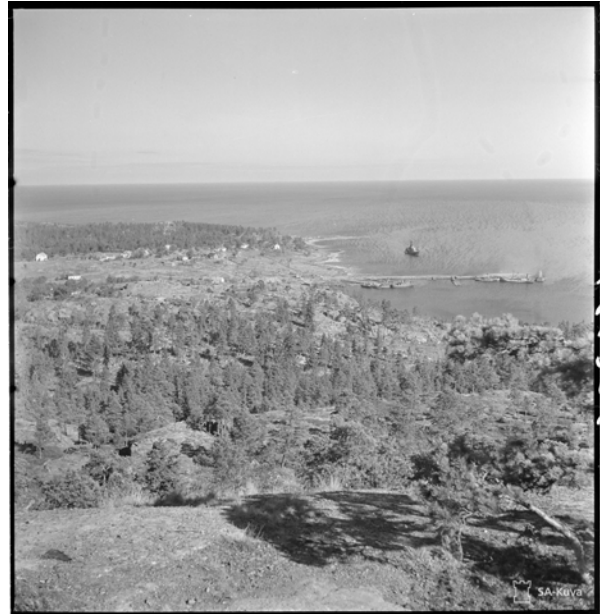
[The view from Hirskallio]

biggest motti was centered on Hirskallio, with some 500 enemy. The most southerly pocket, of 100 men, was on Kappelnemi Cape, south of the harbour.