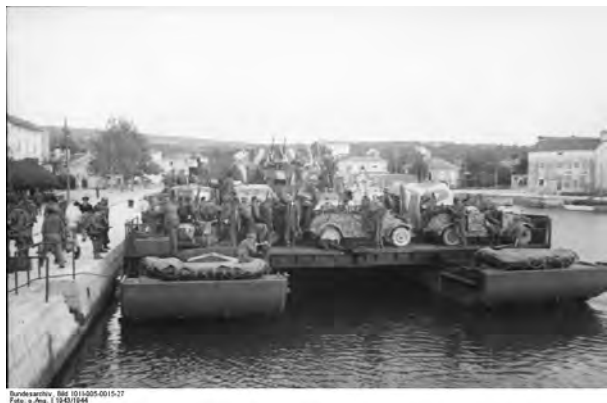
[A Siebel Ferry]

The reader has probably heard of Siebel Ferries. These were purpose-built catamarans, about 32 meters long, with a flat deck that could be used to transport 50-100 tons of cargo, or to form bridge sections. They were armed with 88mm deck guns and 20mm AA cannon. They sailed under their own power, but were very slow, so the Germans commandeered two Estonian tugs, the Pernau and the Polyp , to tow them, presumably in a couple of lines, like regular barges.