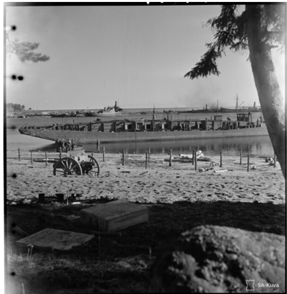
[Aftermath at Suurkylä Harbour]

Under cover of darkness, small groups of Germans converged on the remaining sturmbots , boarded them, and headed out to sea. Captain Sonnemann was one of the lucky ones. His and three other boats reached Tytärsaari Island, 20 Km away. Four other boats also escaped. The rest did not. Some ran out of gas and were strafed by Soviet aircraft the next day, and some reached enemy-held Lavansaari. In all, 85 Germans successfully escaped.