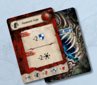
18 Wound cards