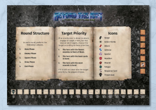
1 Threat Sheet