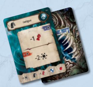
12 Fatigue cards