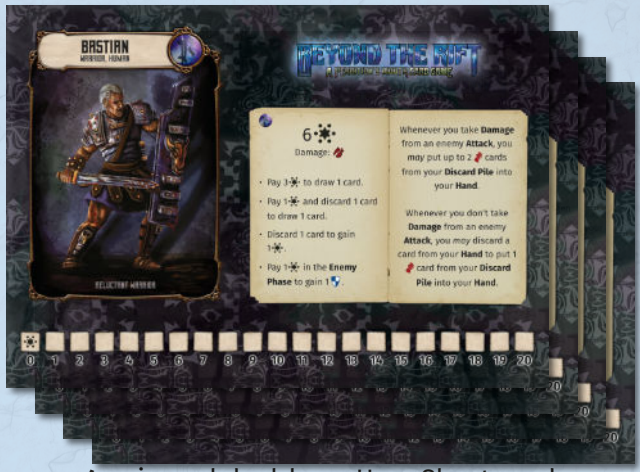
4 universal dual-layer Hero Sheets and 6 pairs of hero specific tiles