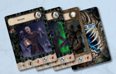
74 Enemy cards