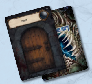
27 Terrain cards