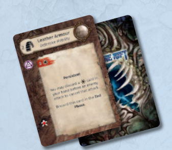
87 Item cards