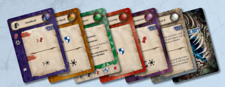
156 Hero cards (26 for each hero)