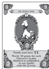
Story cards have purple images.

3. Stories: Choose two Story cards randomly and lay them face up where everyone can easily see and reach them, but where they won't be confused with the discard pile. Return the rest of the Story cards to the box. They won't be used.