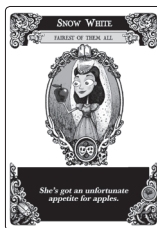
Character cards have full-color portraits.

Spread the 20 Character cards out on the table where everyone can see them. Each player chooses four. All chosen cards are laid face up on the table in front of their owners, where the other players can also see and reach them. Return any unused Characters to the box. They won't be used.