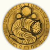
HIEREG TOKEN BACK

Five of the Discovery tokens are locations, and remain in place when revealed. A location token is not considered occupied when revealed. At the start of the next turn, before the storm (and movement of the Ixian Hidden Mobile Stronghold), any faction in a territory with a Discovery token that was just revealed may move some or all non-advisor forces in that territory into the location.