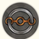
SMUGGLER TOKEN BACK